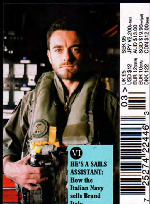
VI HE’S A SAILS ASSISTANT: How the Italian Navy sells Brand Italy