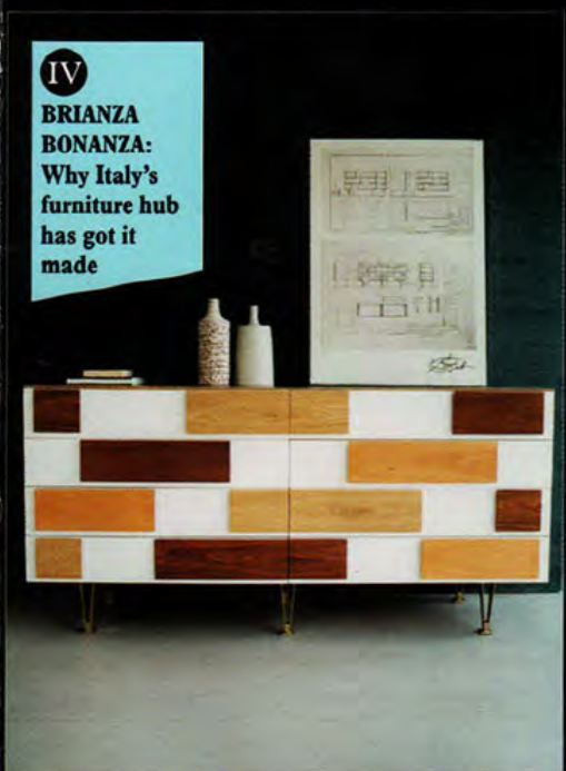
IV BRIANZA BONANZA: Why Italy’s furniture hub has got it made

REBOOT THE NATION: A fresh look at Italy’s strengths and challenges as a new set of politicians, designers and makers do it differently (plus where to eat, sleep and live)