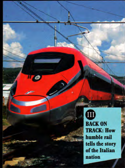
III BACK ON TRACK: How humble rail tells the story of the Italian nation

REBOOT THE NATION: A fresh look at Italy’s strengths and challenges as a new set of politicians, designers and makers do it differently (plus where to eat, sleep and live)