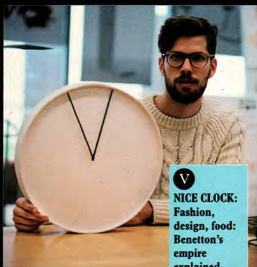
V NICE CLOCK: Fashion, design, food: Benetton’s empire explained