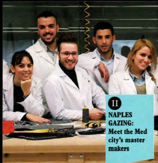
II NAPLES GAZING: Meet the Med city’s master makers