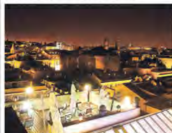
0° 300° Cold and Grill

The D.O.M. Hotel is in a 17th-century monastery.