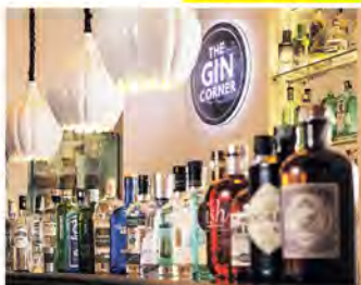
The Gin Corner

0° 300° Cold and Grill fills the roof terrace of the historic center's First Hotel and boasts great city views.