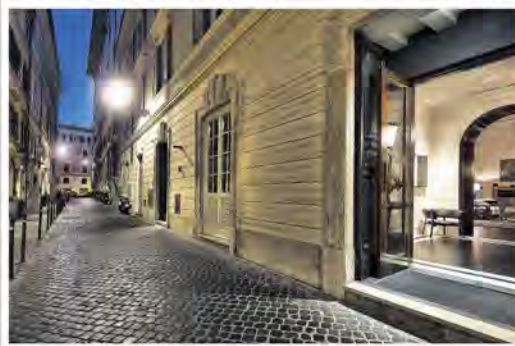
J.K. Place Roma

All-day dining spot Porto Fluviale serves casual Italian dishes, especially Venetian snacks or cicchetti .